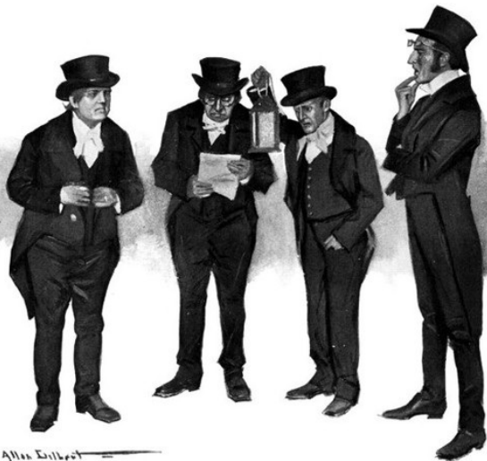
"THE CONSULTATION OF THE ELDERS."

"THERE'S A QUIRK IN THIS, HENDRY," SAID TOSH. "WAS IT MISTRESS DISHART the laddie saw?"